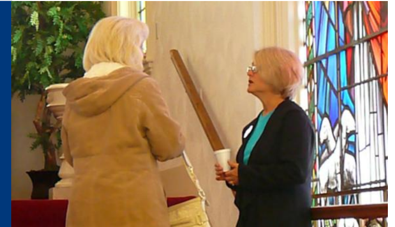
EVERY GIFT MAKES AN IMPACT