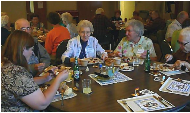
“YOU CAN’T OUT-GIVE GOD”